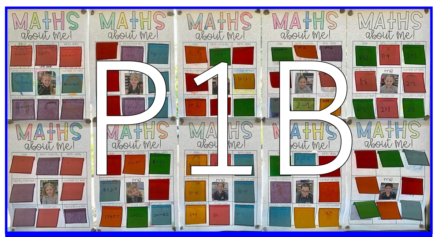
Our Maths About Me - students had to write down some information about themselves: age, birthday, number of people in their family, shoe size, favourite number, house number, number of pets. Then they thought of a maths sum to equal their answers and wrote it on a lift up flap.