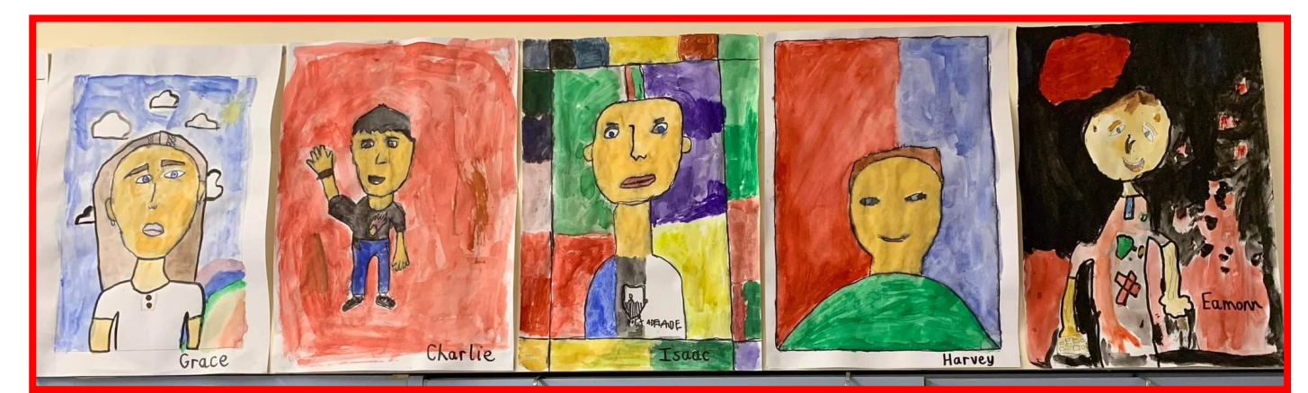
Visual Art- we sketched and painted self portraits to display in our class.